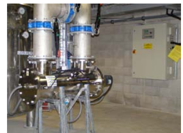
Hanovia UV systems are used across NZ to treat water, waste and public swimming pools